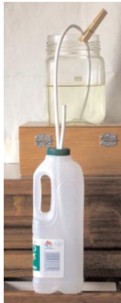
6. Siphoning used cleaning machine fluid from a jar.

I have now joined the group extolling the virtues of being able to see exactly what is there! But be warned, you will be amazed how poor your work will look and how dirty your cleaned movements appear to be under strong magnification; about 20 times in my case.