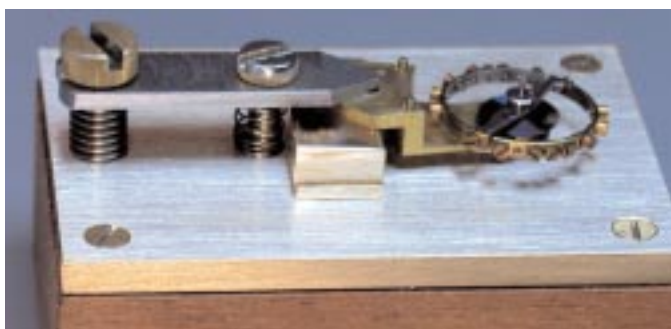
5. Holding a pocket watch balance cock using packing pieces.

The dimensions are not critical; in the example shown the brass plate is 52 x 36mm and the wood block is 19mm high, which has proved satisfactory for both wrist and pocket watches. The screws could have knurled heads, but slotted screws are better as they avoid the danger of knocking the balance, which, with only one pivot supporting it, is vulnerable. The finger is made from gauge plate or from mild steel; which is strong enough.