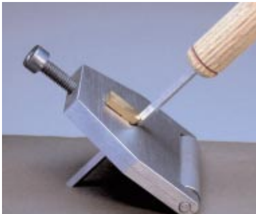
9. A graver sharpener with a safety shoe to avoid the graver shifting.

Since quite a lot of pressure is used during sharpening it is dangerous as well as inconvenient if the graver moves in the tool. The under side of the shoe has a V-groove and the top is flat. If the screw bears directly on the graver it will not stay tight. Commercial tools I have seen do not have this shoe, which is well worth adding to render them satisfactory.