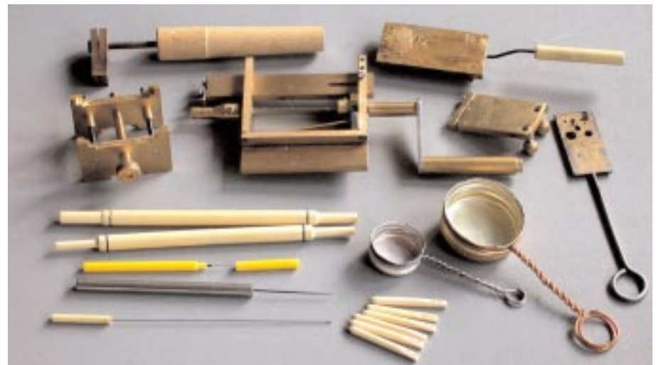
11. A selection of small home made tools (see text).

Plastic knitting needles make good handles for mounting pushers made from blued pivot steel, and sewing needles for manipulating balance springs. □