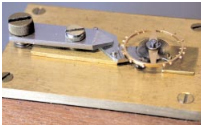
3. Balance cock finger plate holding a wrist watch cock.

It is also convenient to be able to pick up the finger plate to inspect the balance and spring. The balance spring can be adjusted by removing it from the balance and securing it in the cock by its stud. With the cock held in the finger plate the spring is adjusted to lie correctly between the curb pins with the spring collet centred over the jewel hole. Both hands are free to work on the spring and the left hand does not suffer the strain of holding the cock steady for long periods.