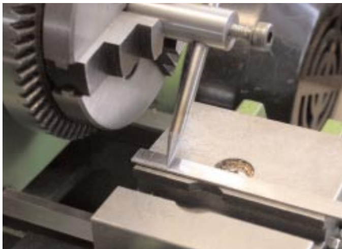
2. Marking the intervals using the lathe lead screw calibration.

Although many replacement parts are made by direct comparison with the broken part, this is not always possible and often the broken part is not the original and may not be correct. It is therefore useful to be able to make absolute measurements when needed. A standard six-inch engineers rule has graduations marked every millimetre which are themselves about 0.2mm wide,