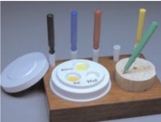
8. An oil stand with a larger piece of pith.

Since an oil stand is in constant use, it should be practical to use and an attractive object on the worktable. The example shown, 8 , was made from a commercial oil cup and set of oilers mounted on a mahogany block. A large piece of pith is fixed to the block with a blob of glue so that it can be replaced when exhausted. The pith holders in commercial oil stands are inconveniently small and soon fail to clean the oiler properly; hence the use of a large disc of pith.