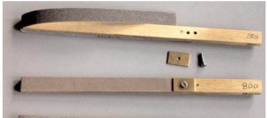
10. Precision emery sticks with a safe edge.