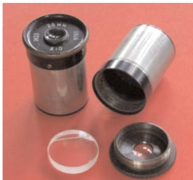
7. Additional prescription lenses for microscope eyepieces.